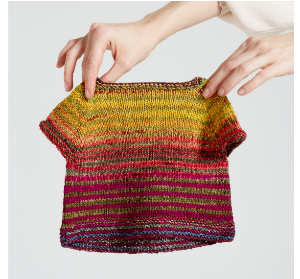
Minik Tee shown in Uneek Sock 55 (size 1)