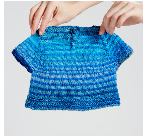
Minik Tee shown in Uneek Sock 64 (size 1)