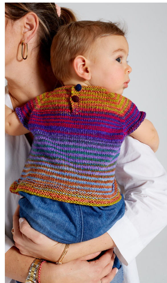
Kayra (9 months) wears size 2 in color 61

Weave in ends, sew on buttons, lightly steam block.